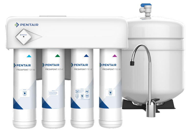
GRO-475M, (with filter life monitor) shown