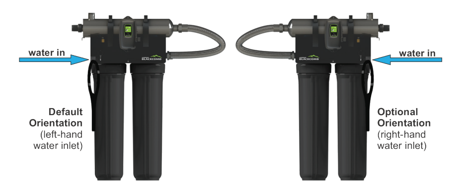
Figure 2. System Orientation (water inlet)

Step 3: Carefully lower the filter head (or heads) from the rack assembly and rotate 180 degrees. Reassemble onto the rack assembly and take note of the arrows located on the top of the filter heads indicating water flow (which now should be indicating a flow direction of right-to-left).