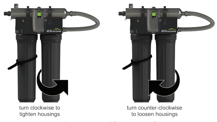
Figure 5. Cartridge Removal

Step 9: Install the UV sensor (BLACKCOMB <sup>6-1</sup> systems only) . Align the flat portion so it faces the gland nut end and matches up with the half metal lip on the sensor port (see Figure 6). Insert the sensor so it is fully seated and hand tighten the sensor nut. Insert the sensor connector into the IEP port located on the right side of the controller (Figure 7). For the sensor to be recognized by the controller, the controller power must be plugged in last. Do not plug the controller power cord in before the last step.