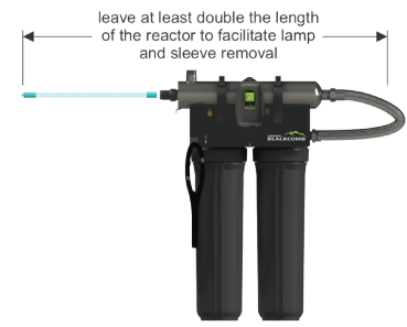
Figure 3. Lamp Removal Spacing

Step 2: The use of a by-pass assembly is recommended as it will allow you to isolate the UV system This will allow for easier access in case maintenance is required.