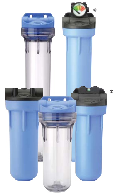
*Shown with differential pressure gauge. Gauges sold separately.